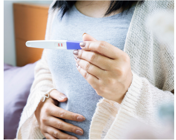
Cornell Health can assist you with your early pregnancy health needs and recommend a pregnancy care practice in the community.

supplements containing at least 400mcg of folic acid taken every day both before and during pregnancy can help to reduce the occurrence of some birth defects such as spina bifida. Eating foods such as dark leafy vegetables, liver, fruit and whole grains can also supply a type of folic acid.