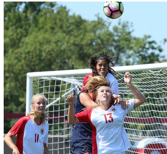
Rest & careful observation are needed after concussion.

Symptoms of a concussion are usually temporary, but may last for days, weeks, or even longer. Watch for new symptoms. If you feel something is "not quite right," or if you're "feeling foggy," talk with your health care provider.